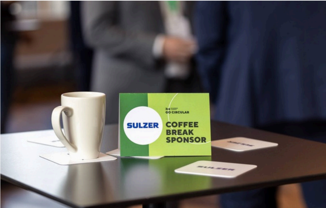
EFFECTIVE BRAND VISIBILITY