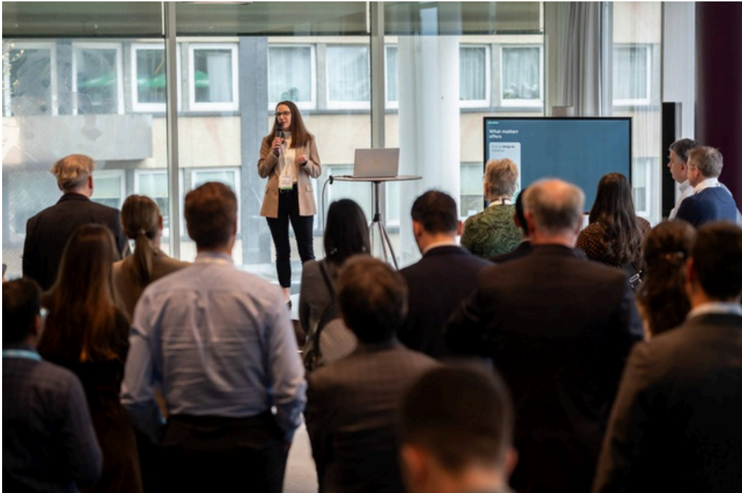
SHOWCASE YOUR PRODUCT