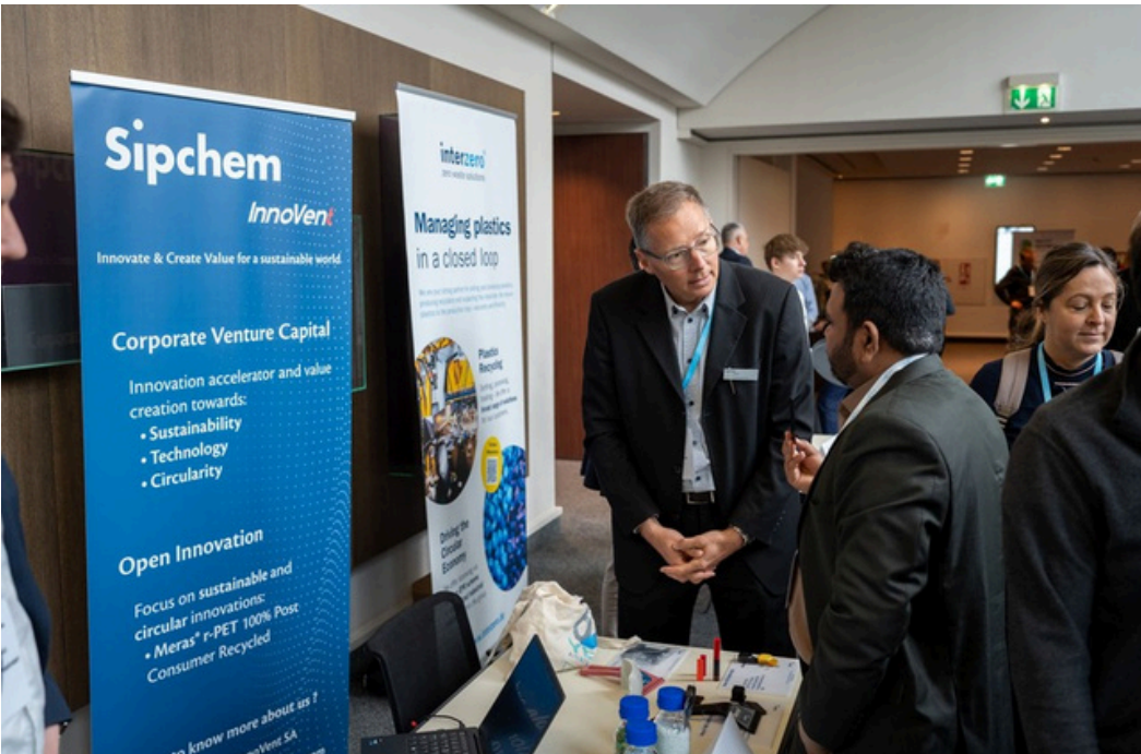
HIGH-QUALITY LEAD GENERATION