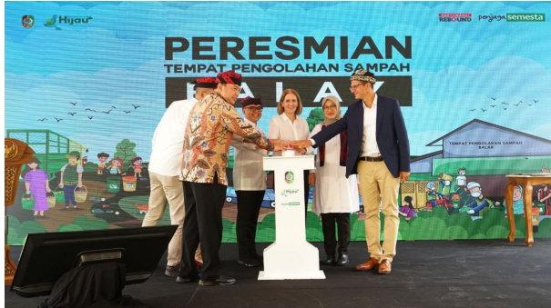
Committed regional government and supporting policies