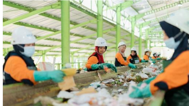
Scalable and fit-for-purpose waste management system design and infrastructure