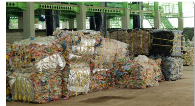
Valorisation of recyclables