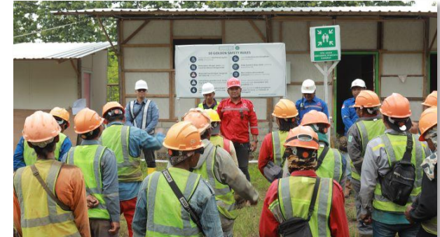
Capacity and knowledge building