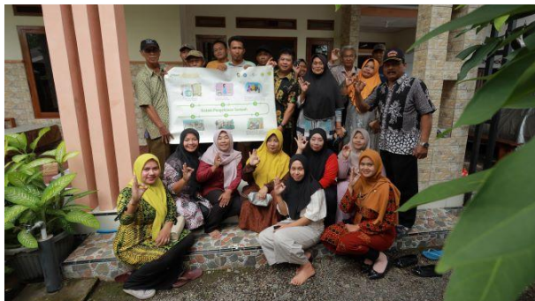
Behavior change campaigns